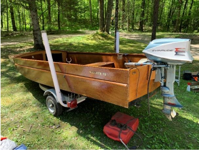
Boat, motor, & trailer - $3,500