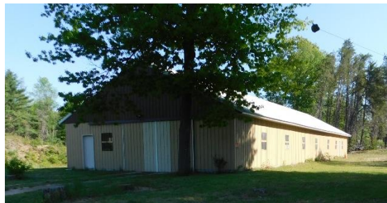
South end of our storage building

Mission – Find “new” storage for clubs needs i.e. clay targets, golf carts, trap machines, UTV, lawnmower, etc. We’ve looked at five or six options - none of them made any sense when you consider we own a 40’ x 120’ pole barn which we presently lease out.