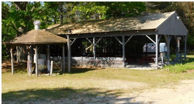
Cook shack and lunch pavilion

Since the shack was in such disrepair it has been torn down. We are replacing it with a storage cabinet installed at the end of the shooting line pavilion and improving the cook shack to accommodate a scoring office.