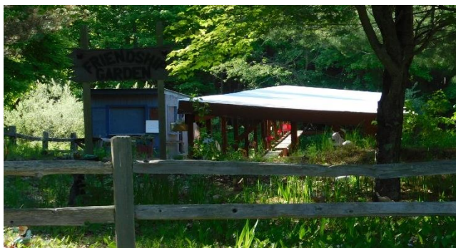
The grey structure was the target shack

Last year our neighbor insisted that we remove the muzzleloader target / scoring shack from his property. The shack was partially over the property line.