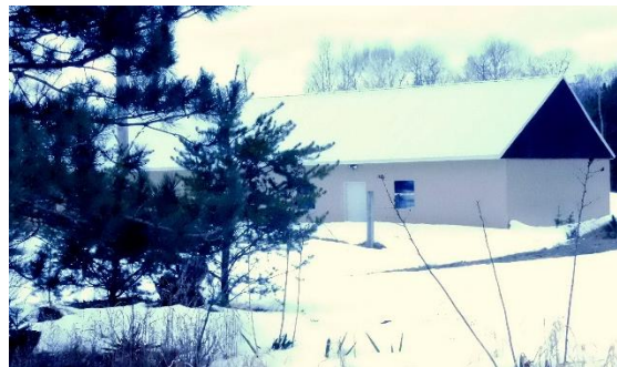
North end of our storage building

A recommended solution: use the north end (24’ x 40’) of this pole barn. We would have to install a garage door, pour a concrete floor, and put in a graveled access from our entrance road to the new garage door. And, if necessary, a panelized, moveable partition to separate club storage from lessor.