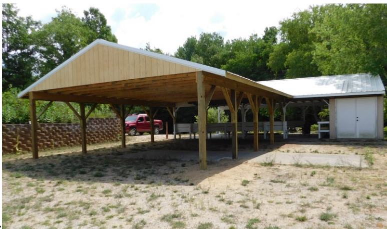
The first phase our pistol range expansion