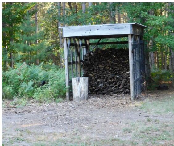
One of the firewood shelters was cleaned out, the wood sorted and stacked.